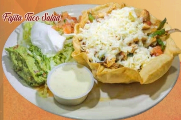
Fajita Taco Salad