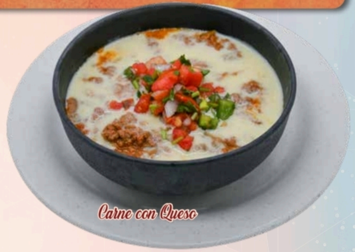
Carne con Queso