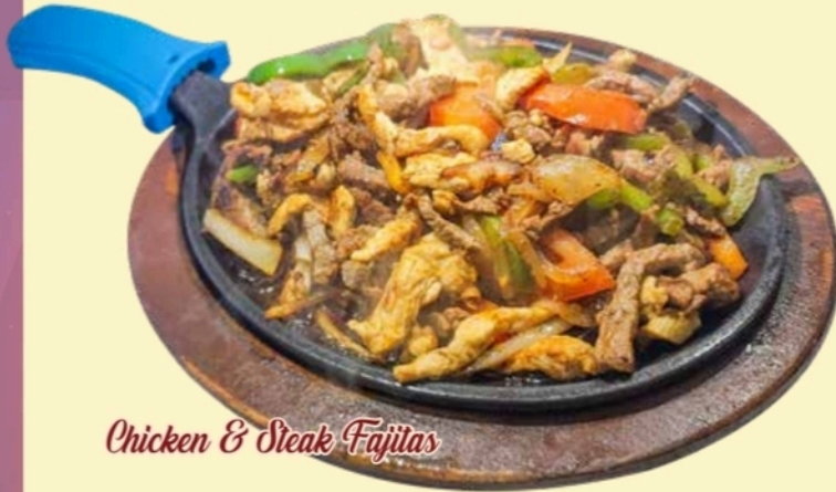
Chicken & Steak Fajitas