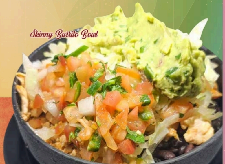
Skinny Burrito Bowl

8 oz. Pork served with rice and black beans. Garnished with lettuce, avocado, pico de gallo, jalapeño pepper, cambray onions, and tortillas. 18.99