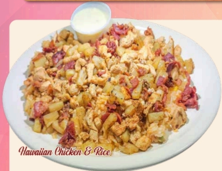
Hawaiian Chicken & Rice