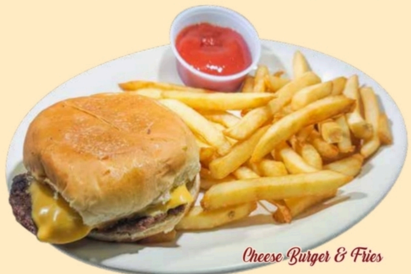
Cheese Burger & Fries