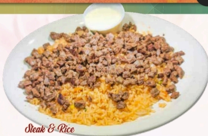
Steak & Rice